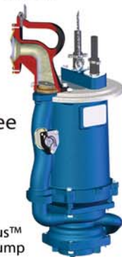
Omni Grind Plus™ Grinder Pump

Barnes® Omni Grind Plus™ , centrifugal grinder pump, offers higher head operation, and thus cutting development cost by reducing or eliminating the number of lift stations required on large projects or when connecting to distant sewer intercepts. The unit can pump up to three miles in flat terrain.