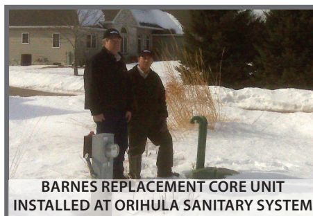
BARNES REPLACEMENT CORE UNIT INSTALLED AT ORIHULA SANITARY SYSTEM

"Through the years, Barnes pumps perform, have a longer life span and do not have the call backs we've experienced with other pumps."