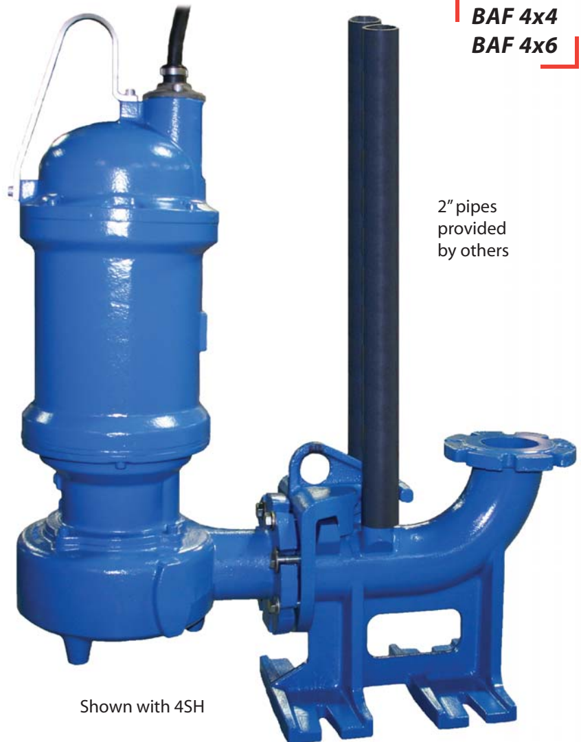
Shown with 4SH

Break Away Fittings, consisting of a base elbow and slide rail adapter plus brackets and hardware, provide for easy installation and removal of Barnes 4SH and 4SE sewage pumps in permanent wet well installations.