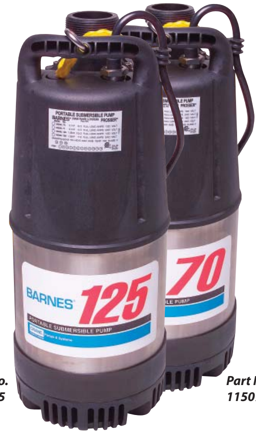
Part No. 115125