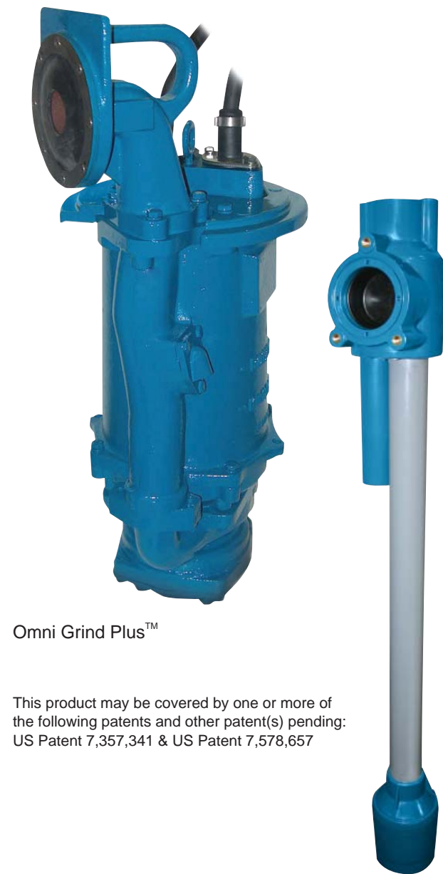
Omni Grind Plus™

This product may be covered by one or more of the following patents and other patent(s) pending: US Patent 7,357,341 & US Patent 7,578,657