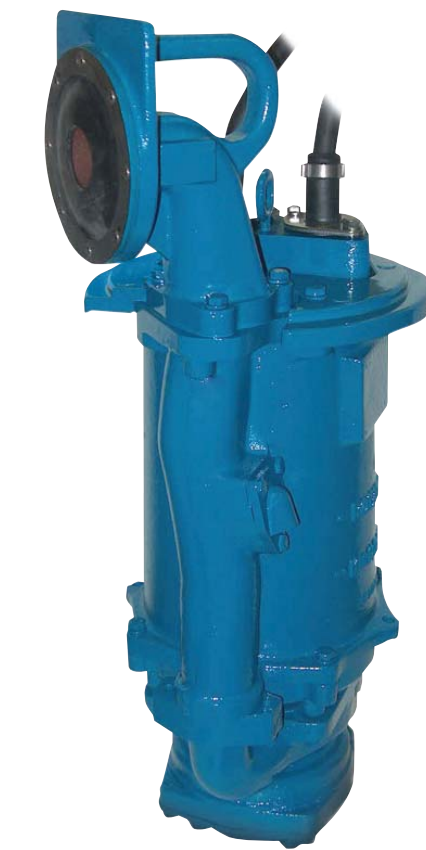
Omni Grind Plus

This product may be covered by one or more of the following patents and other patent(s) pending: US Patent 7,357,341 & US Patent 7,578,657