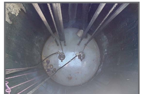
SH PUMPS IN WK NORTH MEDICAL CENTER WET WELL