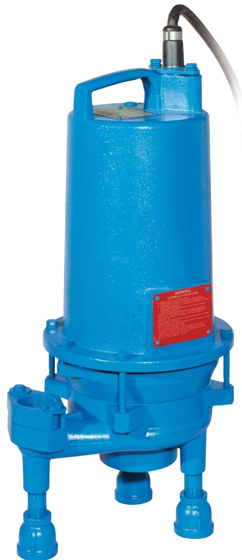
*Control Panel Optional

Barnes exclusive quick connect power cord, optional controls and adjustable legs make the PGPP easy to install and maintain. The hardened stainless steel cutter with the reversible shredding ring doubles the cutting life. Add to these features the abrasion resistant silicon carbide mechanical seal and the PGPP is the most robust and reliable grinder pump on the market.